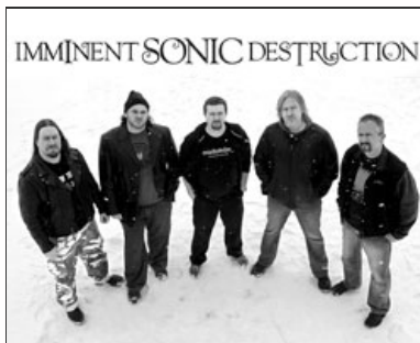
Above, Imminent Sonic Destruction : is coming, better duck and cover. (Did their feet get cold?)

Clearly, with Recurring Themes , Imminent Sonic Destruction wants to put some fire into the belly of progressive metal. There's enough modern metal nuances (read: harsh and sometimes 'core') mixed with the complexity and melody of traditional melody to create an impressive and entertaining venture. Quite recommended.